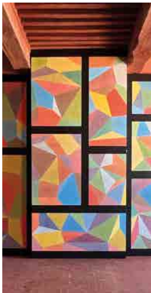
Salle des figures géométriques, Sol LeWitt, Wall Drawing #752, 1994, commande publique CNAP